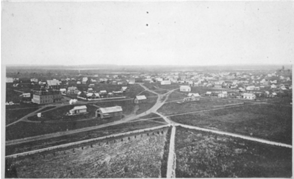
Lincoln As Seen From The Capitol in 1870.