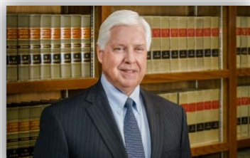
Scott D. Kelly