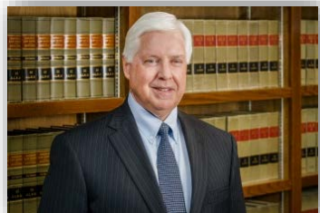
Scott D. Kelly